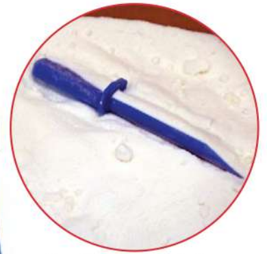
Easy To See - the bright colours allow it to be easily seen if left in the powder